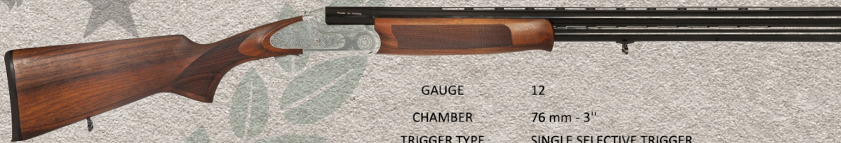
ARM100 YSR12 XL