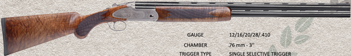
ARM100 BH12 XL