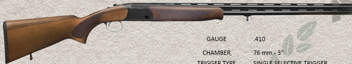
ARM100 KND410 BLACK