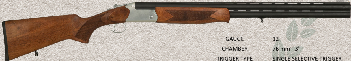
ARM100 YSR12 SILVER