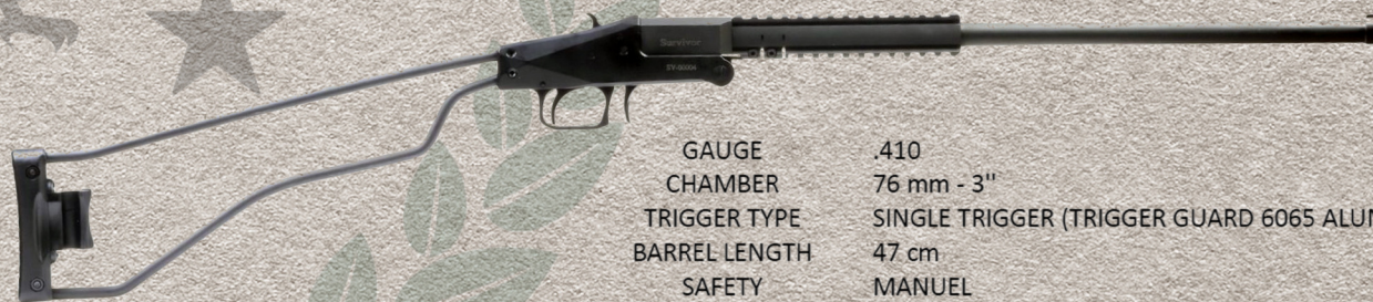
ARM400 MS410 SURVIVAL