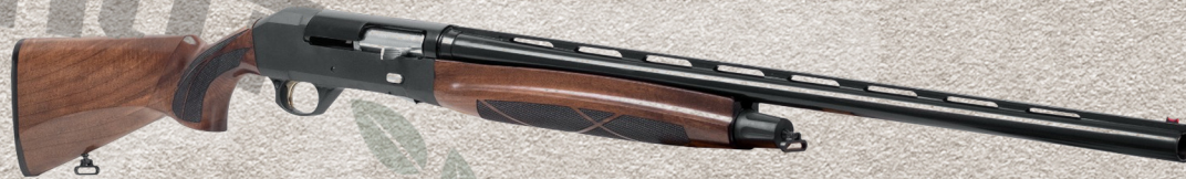
ARM300 EMK12 WOODEN