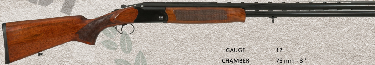
ARM100 YSR12 BLACK