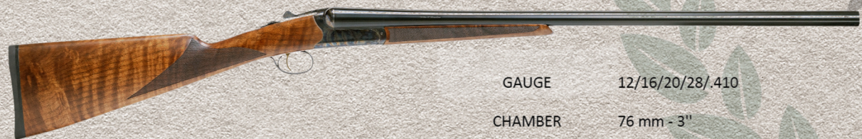
ARM200 F12 CC