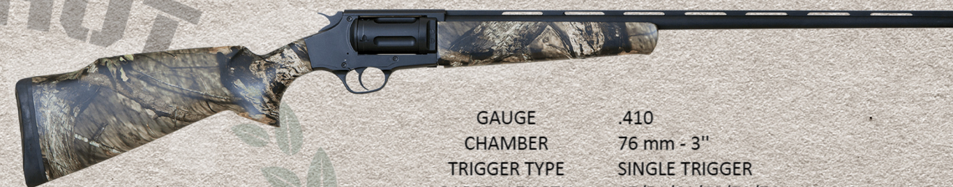
ARM600 AKN410 CAMO