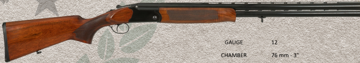
ARM100 YSR12 BLACK ALLOY