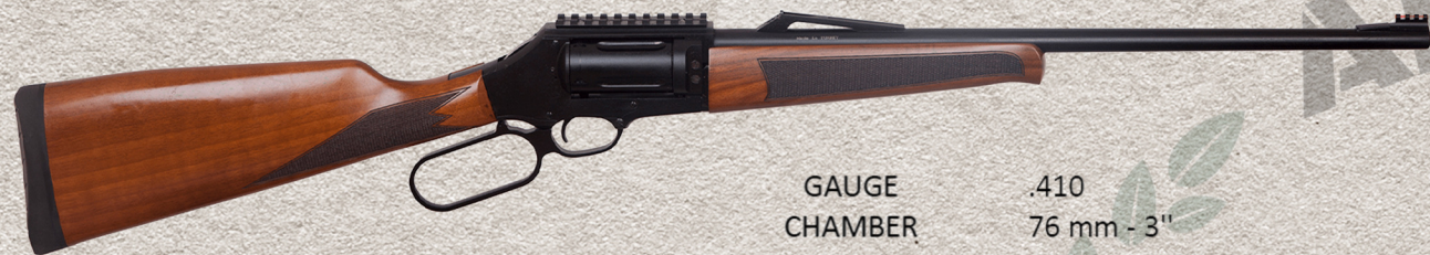
ARM600 AKN410 LEVER