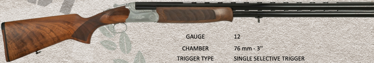
ARM100 YSR12 L