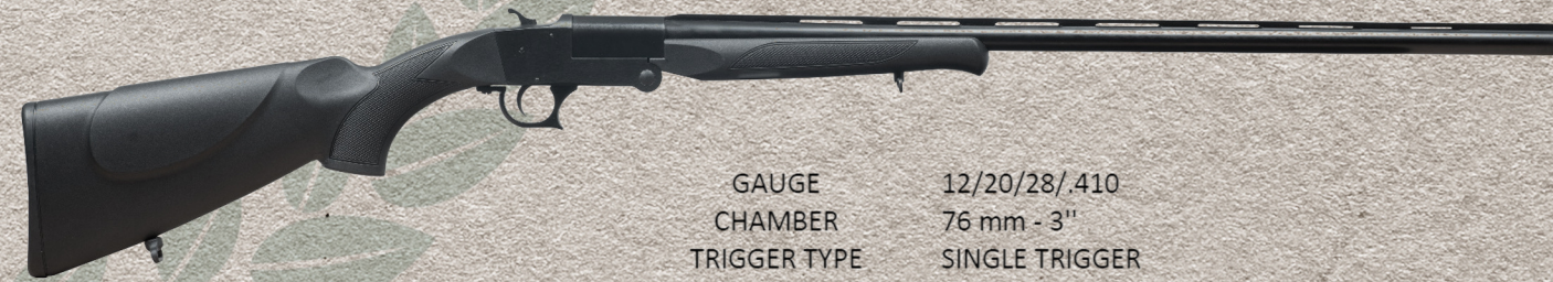
ARM400 KND12 SYNTHETIC