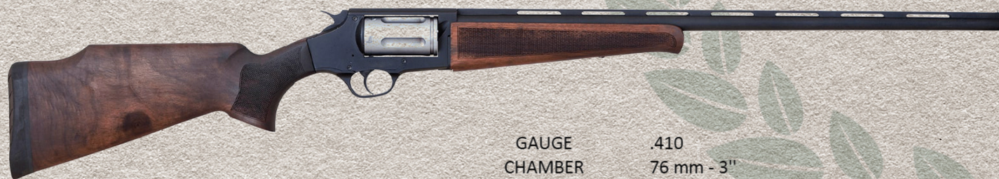
ARM600 AKN410 WOODEN