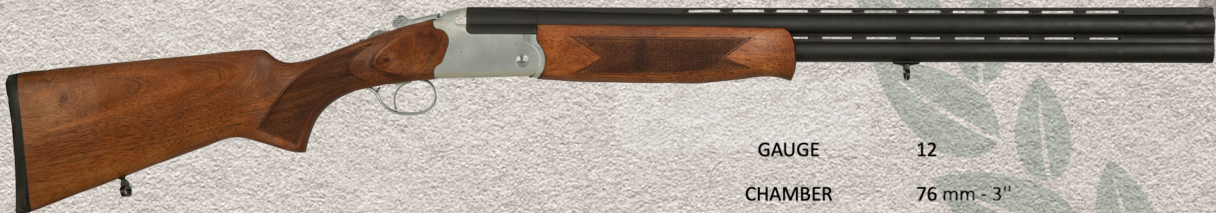
ARM100 YSR12 SILVER ALLOY