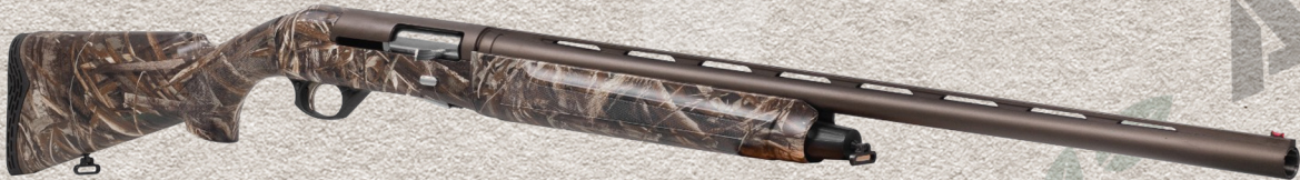
ARM300 EMK12 CAMO CERAKOTE